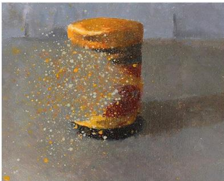
Image (right) The Vegemite Jar (2016), Oil on Canvas, 8x10 inches.