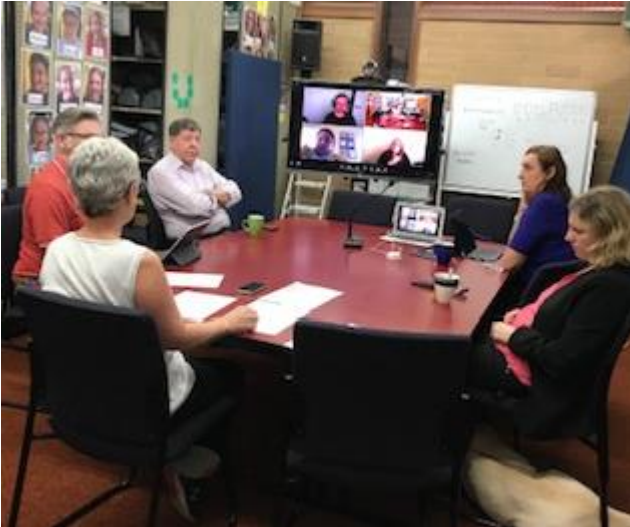
Image shows the Support Skills staff meeting by "Zoom" last week so that several staff members could work from home.