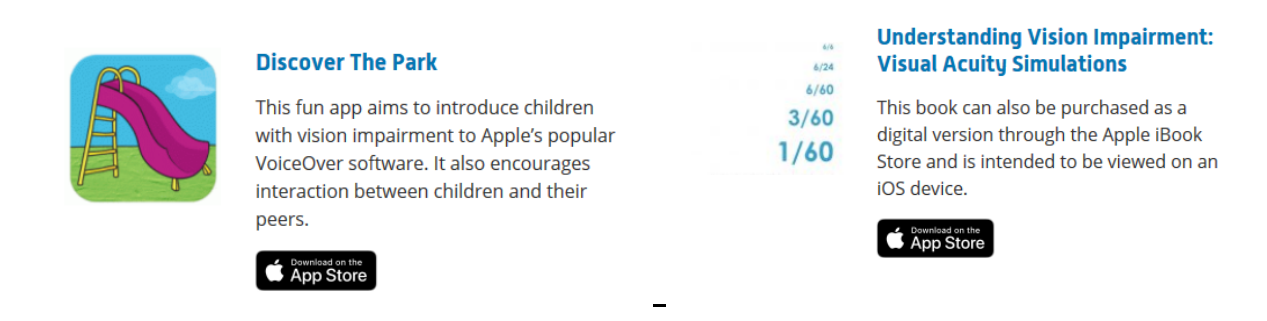
Image shows two apps as they are displayed on the RIDBC website, Discover The Park and Understanding Vision Impairment: Visual Acuity Simulations.