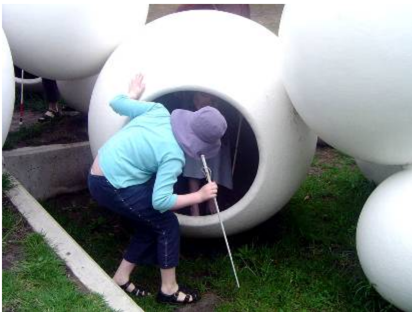
Image: Student who is blind investigating a Peter Corlett's "Tarax Play Sculpture" at the McClelland Art Gallery + Sculpture Park.

Participants also explored works of art under blind-fold, investigating the use of visual description, tactile diagrams and touch access.