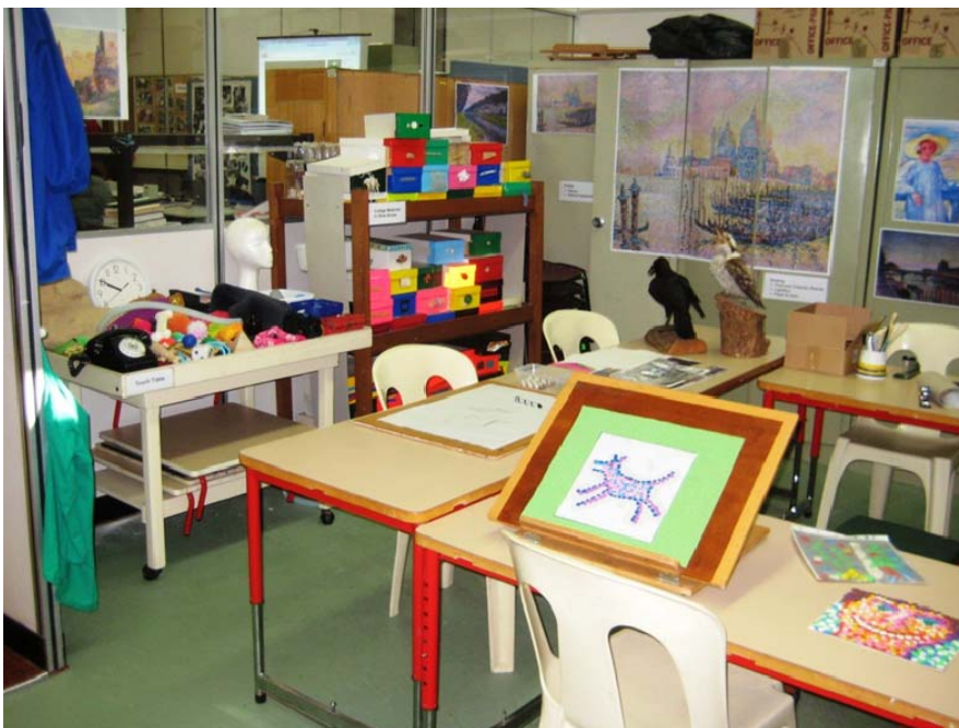
Image: the Art room at Statewide Vision Resource Centre

Under blindfold, participants became artists with vision impairments and used adaptive tools and materials to draw a hand-held item. They used Raised-line or Tactile Drawing Kits, Crayon on Litho over Wire-boards, Spur-wheels on paper over rubber mats, Wikki-Stix, Aromatic Markers and Swell (stereo) paper.