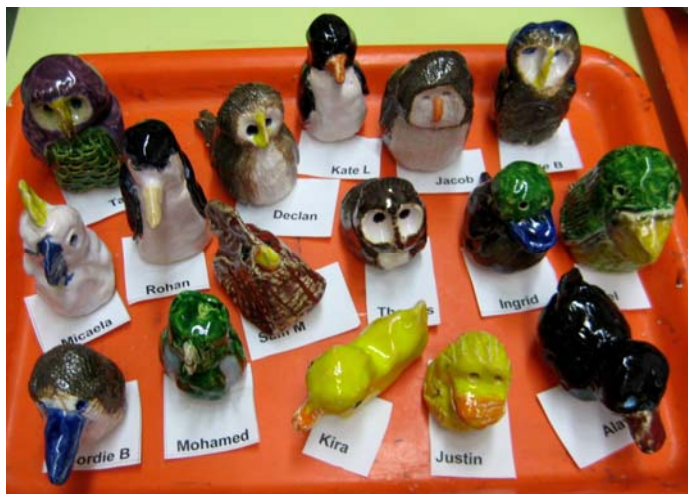
Image: ceramic birds created by students at the Support Skills Program.

www.eyeland-design.com/CD-MSD-EN/VS-MSD-EN.swf Vision Simulation - interactive pdf.